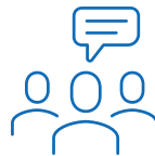
Live Training Workshops