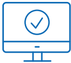
On-Demand Web-Based Training

In order to offer our clients flexibility, customization and convenience, WCG Avoca offers three delivery methods of our training tools: